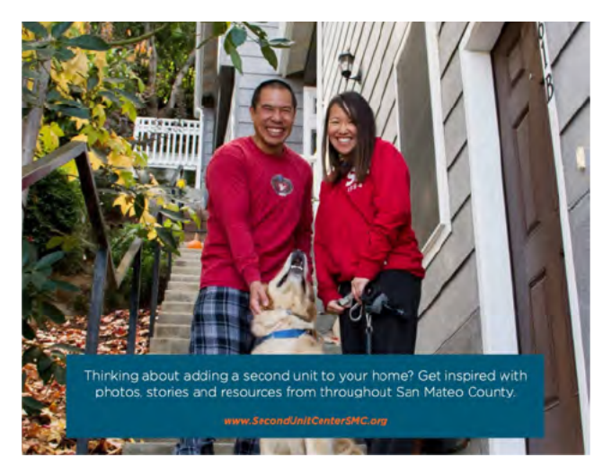
San Mateo Second Unit Resources Center