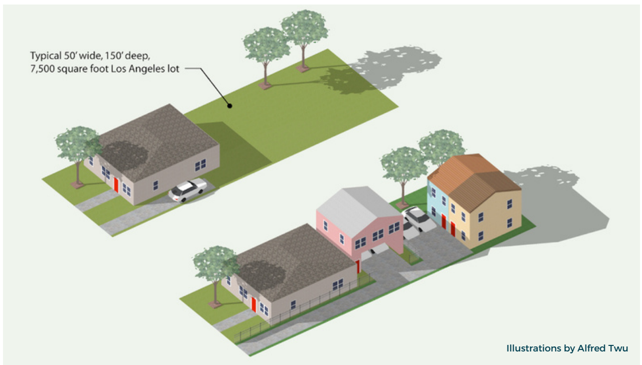
Lot split with home + ADU on front lot, duplex on rear